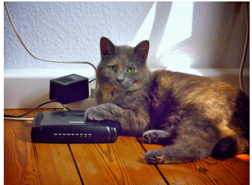
“Perla schwört auf Siemens Router”