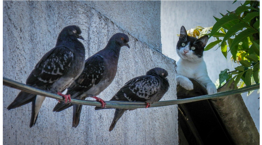
Untitled image