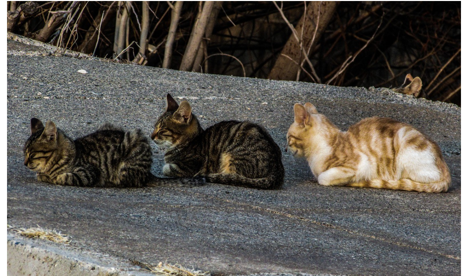
Untitled image by dimitrisvetsikas1969 – public domain – https://pixabay.com/en/cats-stray-in-a-row-three-cute-1753883/