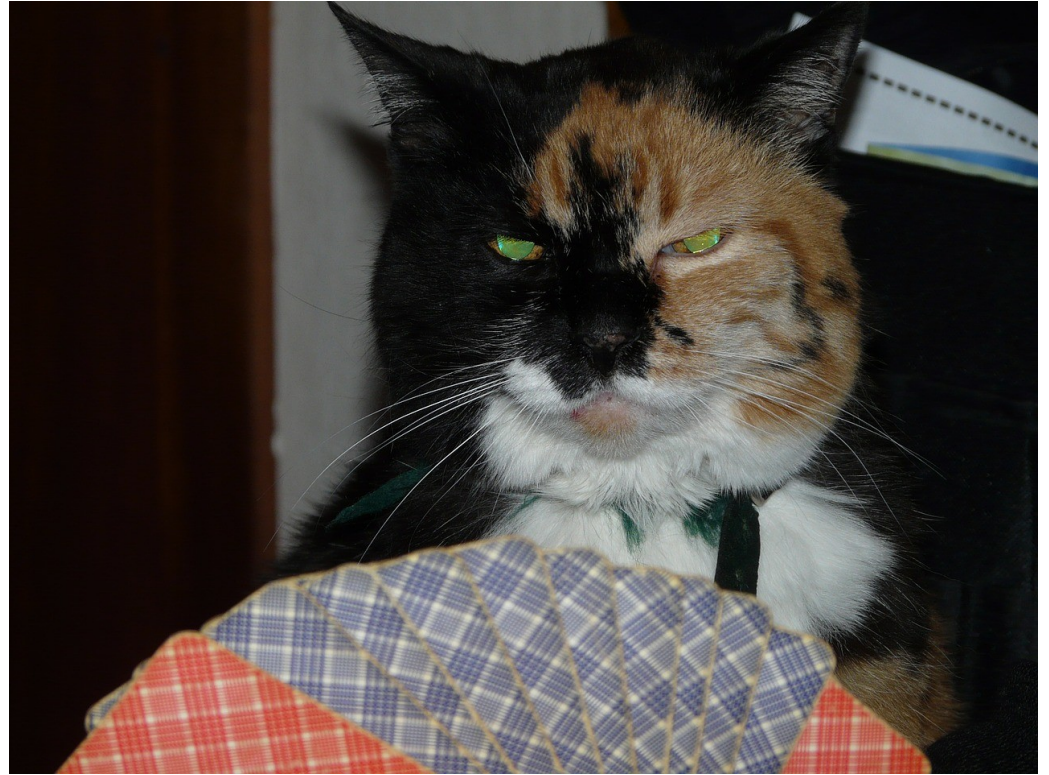
Untitled image