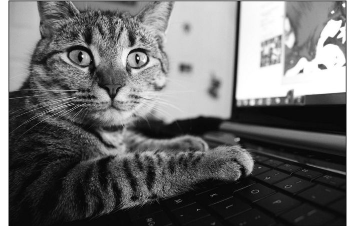
"Keyboard cat"