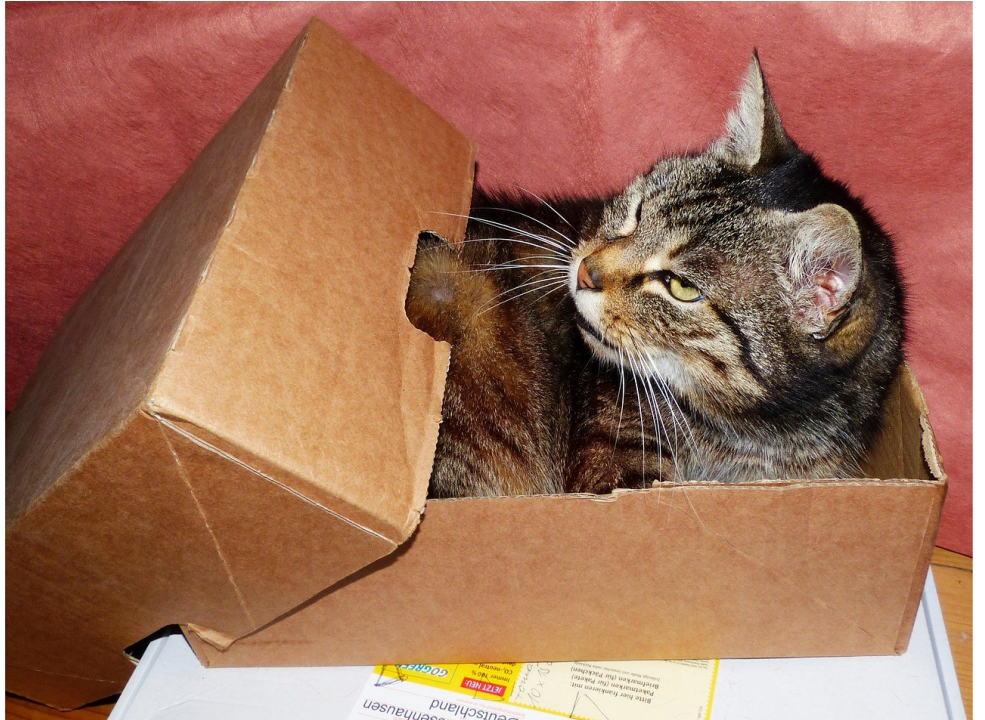
Untitled image